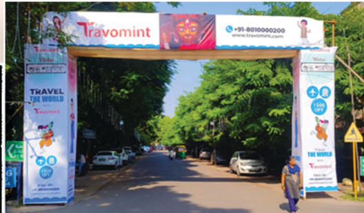
Main Gate by Travomint