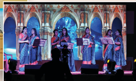
LED Board @ Back Stage